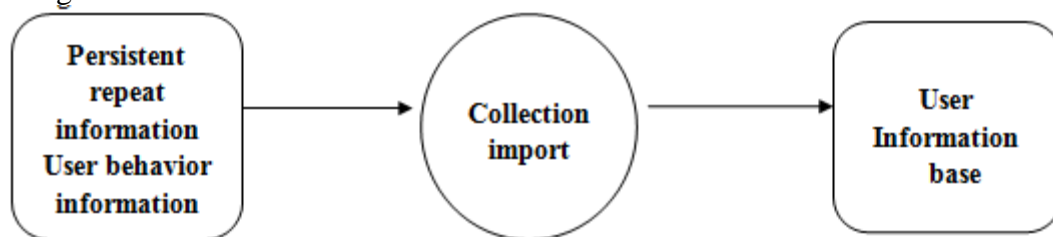
Fig 3.Establishment of user information base

The three types of basic data of the reader are collected, collected and imported, and the basic data is pre-processed before the database is built, which reduces the redundancy of data and the interference of irrelevant information. The pre-processed data is analyzed and mined, the concept and subject of the input information are extracted, the fields of the user information base are parsed, and the data is added to the reading promotion object information base. Reading the promotion object repository needs to be updated based on changes to the web log and the tracking log. By establishing a library of reading and promotion objects, more valuable information and patterns can be extracted from them, thereby improving the matching degree of the reading promotion model to the needs and development trends. The construction of the reading and promotion reader database is shown in Figure3.