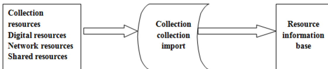
Fig 2 Read the construction of promotion resource information base

The basic data used to establish the reading promotion resource information database includes three categories, the first category is the library's digital library resources, the second category is network resources, and the third category is other shared resources. Among them, digital library resources include books, documents, audio and video, pictures and other physical resources, as well as various types of electronic resources. Collect and import resource data, clean and pre-process resource data, filter out useless information, and avoid duplication, redundancy, and noise as much